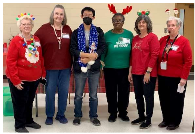
New Officers, Greater Atlanta AVC

Finishing on an up note, we have 6 members that are new or renewing Dixie memberships. I'm hoping to have more join Dixie.