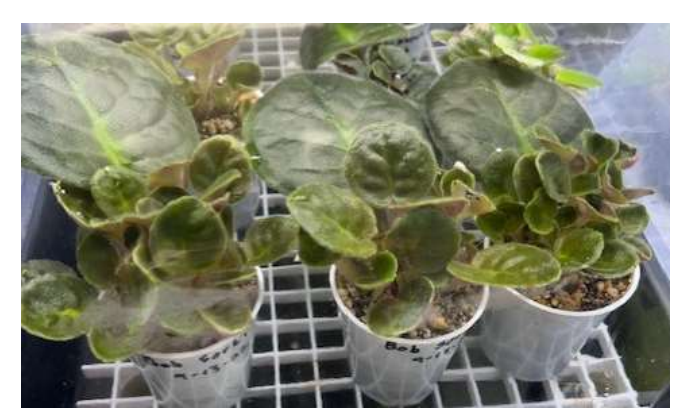
Most excitedly, we began our first foray into growing show quality plants by starting a project

The Acadiana African Violet Society has had an active late fall and early winter. We have had programs on basic grooming, African Violet trailer care (guest presenter: Wilhelmina Allen, LLAVS), INSV symptoms and testing, and custom mixing African Violet soil. We hosted our Christmas party with a potluck style spread of holiday treats.