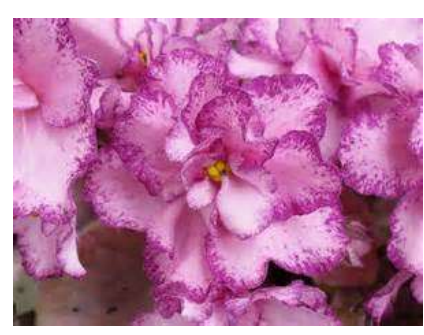
Buckeye Cranberry Sparkler

After the show, we'll have a rest period (???) of about five weeks, and then we'll participate in the Spring Plant Festival at the Botanical Gardens at University of South Florida. This is a 2-day event, and there are usually between 50 and 70 participating vendors from throughout the State of Florida. It's always well attended, and it's a great way for us to spread the word about the wonderful world of African violets!