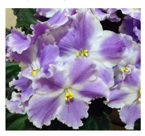
Lyon's Lavender Magic