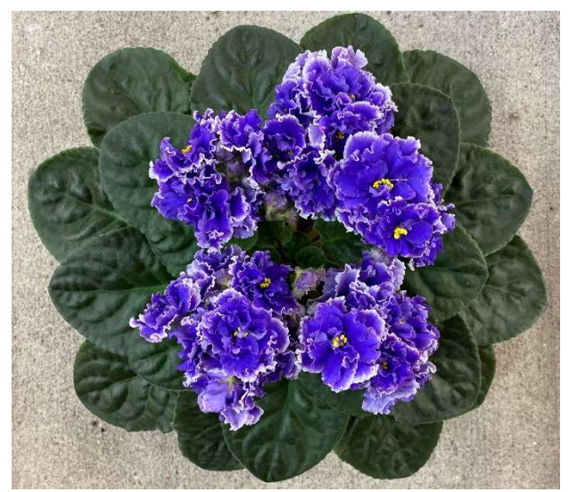
Cajun's Plum Crazy