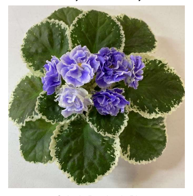
Cajun's Pandemic Blues