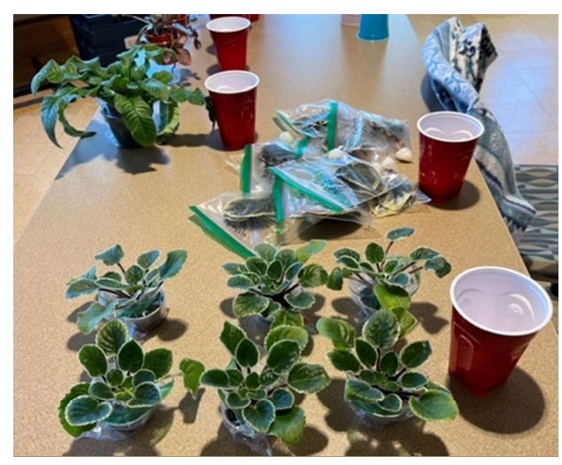
The Raffle table