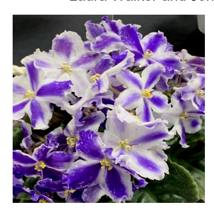
VaT Winter Landscape