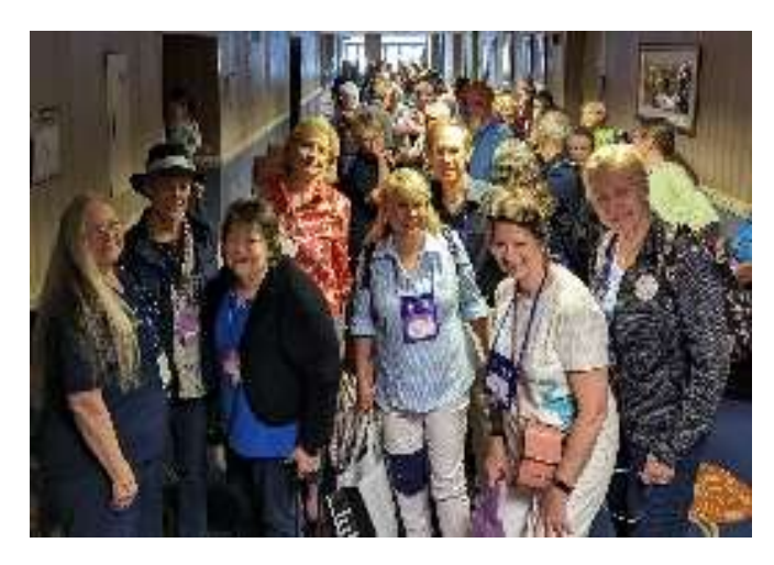
At the AVSA convention

In May, we had our last gathering before our summer break and it was a fantastic party! Members brought in all kinds of delicious food for