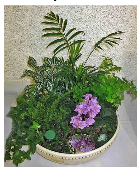
Container gardens call for skill and technique, too

Like musicians and writers, even floral designers with natural talent must work on their skill. I can picture a design in my mind, but without the skill to make it work, it's likely to, quite literally, fall flat. (I know. I've had that happen.) Skill involves learning about various mechanics used in floral design—glue, wire, floral tape, "frog" pin holders—and using them until it becomes natural.