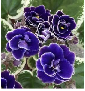
#1910 Cajun's Remember Me (B.Thibodeaux) Semidouble grape pansy/white ruffled edge, pink fantasy. Variegated, cream and pink. Standard