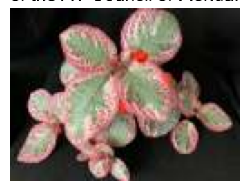
Episcia Canadian Clone 'Cleopatra'

*Reprinted from "The Florida Connection, newsletter of the AV Council of Florida.