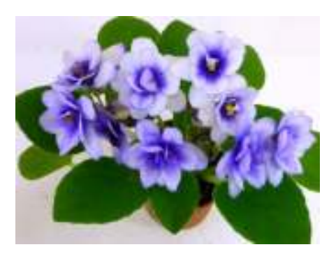
Optimara Little Cheyenne