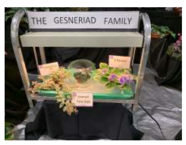
Tampa AVS display at Florida State Fair